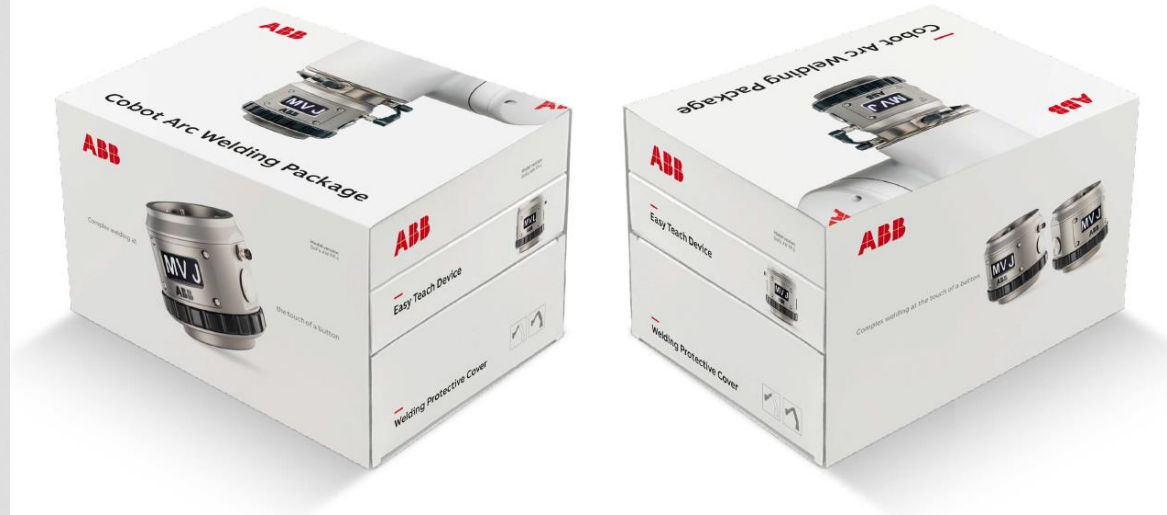
ABB is a single source for all major components incl. package, robot, gripper, and software, making it easy for anyone to buy and set up the device